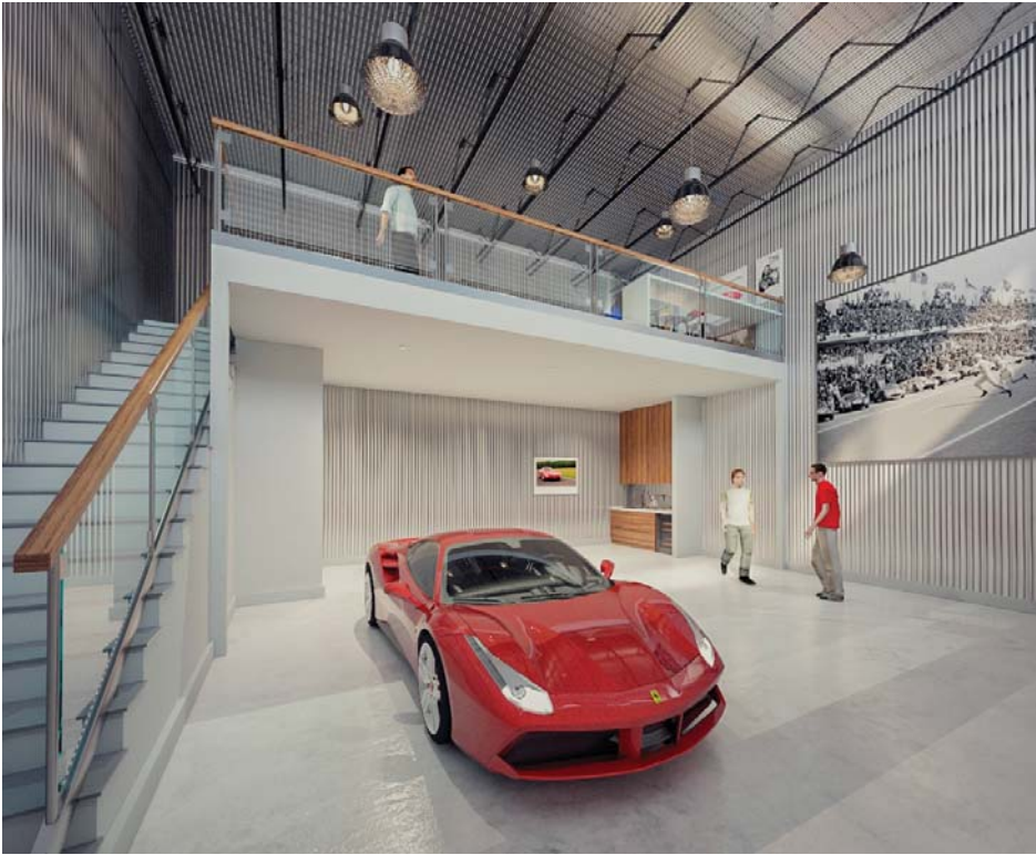
View of Double Garage with metal wallpanels, coffee bar, wetbar and epoxy flooring.