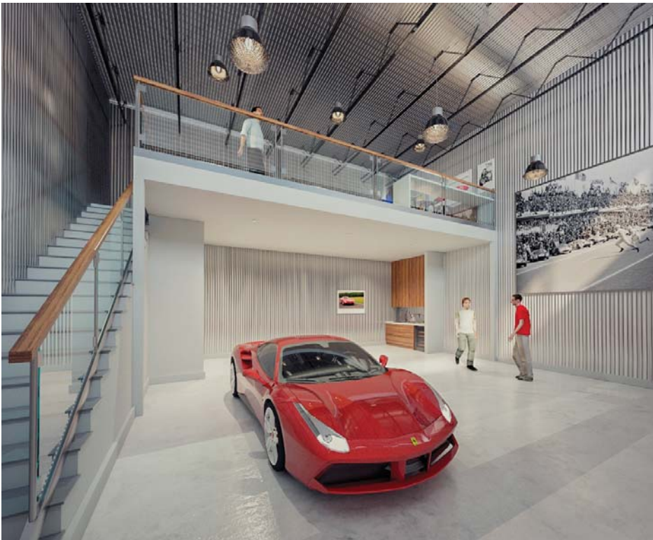
View of Double Garage with metal wallpanels, coffee bar, wetbar and epoxy flooring.